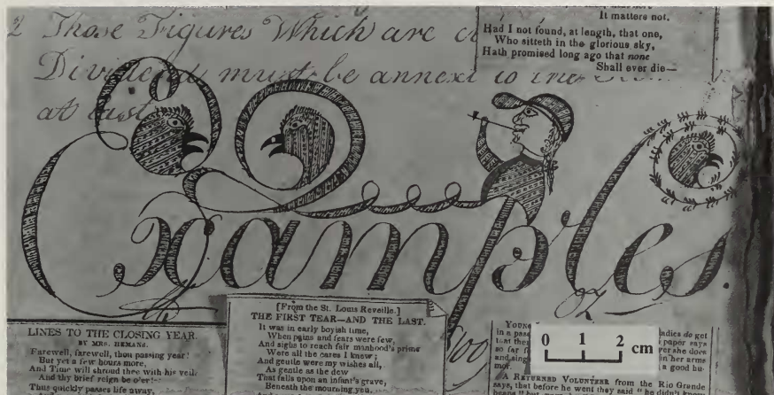
FIG. 2. The man's Hessian pigtail and clay pipe reflect the Pennsylvania Dutch influence. Note the patterned detail of the letters and the four figures, also the leaf-like marks on the flourish encircling the rightmost bird. The "E" overlaps two lines of writing above the heading. The "P" and "L" overlap the line of writing below the heading. Newspaper clippings were glued into the book at a later date.